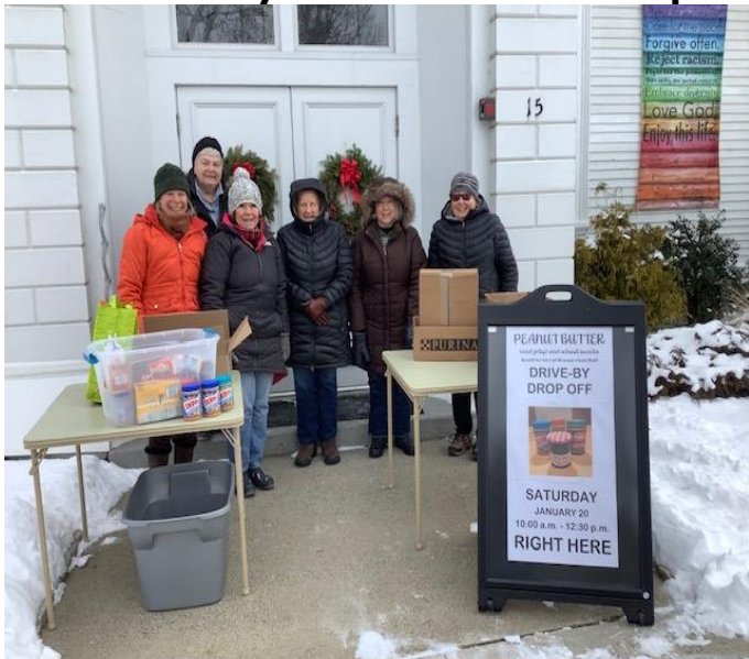
Missions Peanut Butter Ladies