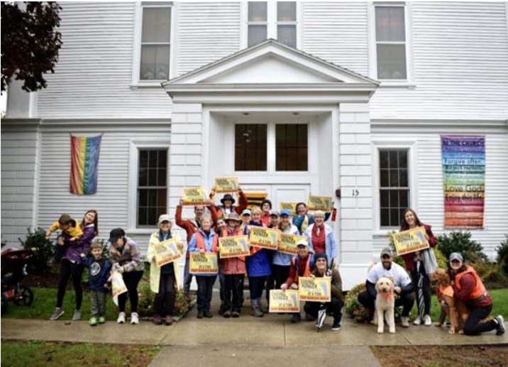
The Crop Walkers

CROP Walk 2023 was a big success - despite some very wet weather on Walk day!! As I walked along though, the weather had a spiritual impact on me, as I thought of the CROP Walk saying - "We walk because they walk." A little adversity added to the poignancy of the day, as I felt more connected to the many, many people at home and around the world who benefit from CROP Walk funds.