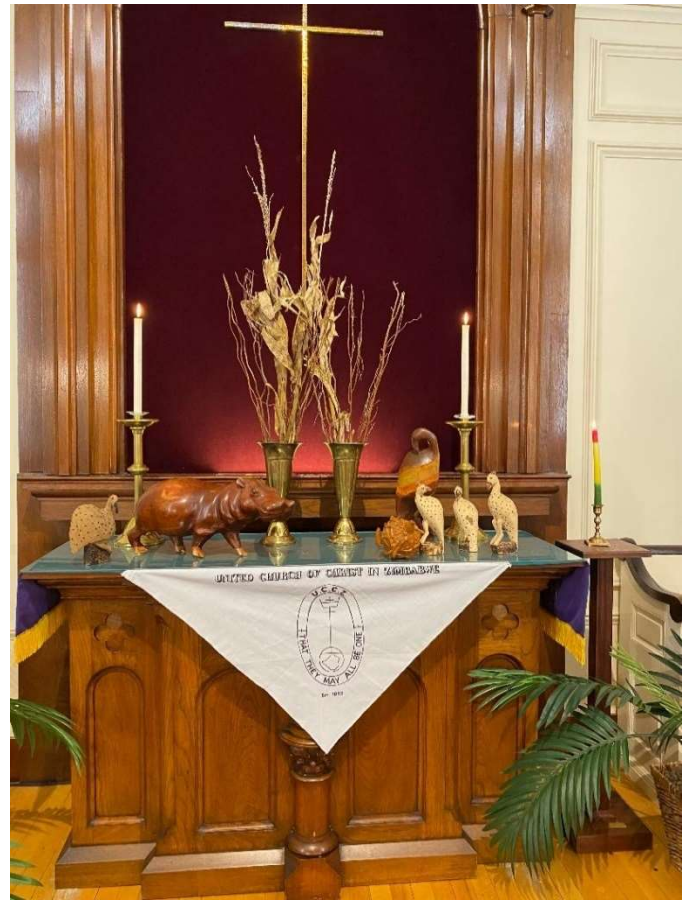
Our beautiful altar celebrating Ukama Sunday