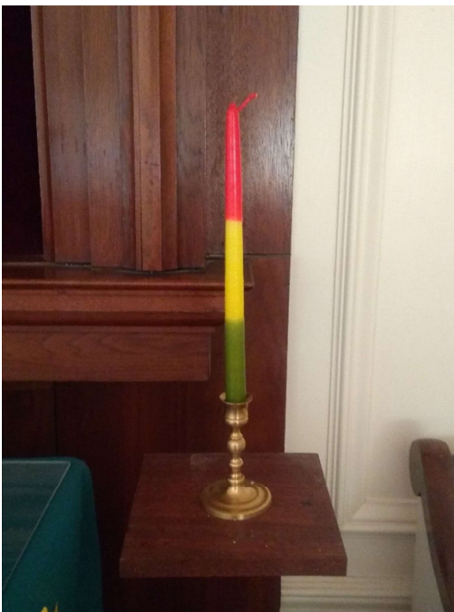
Beautiful Zimbabwe Candle