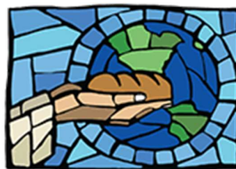
World Communion Sunday