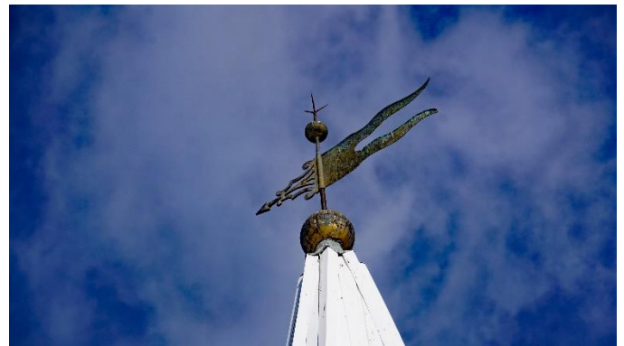
Our Steeple