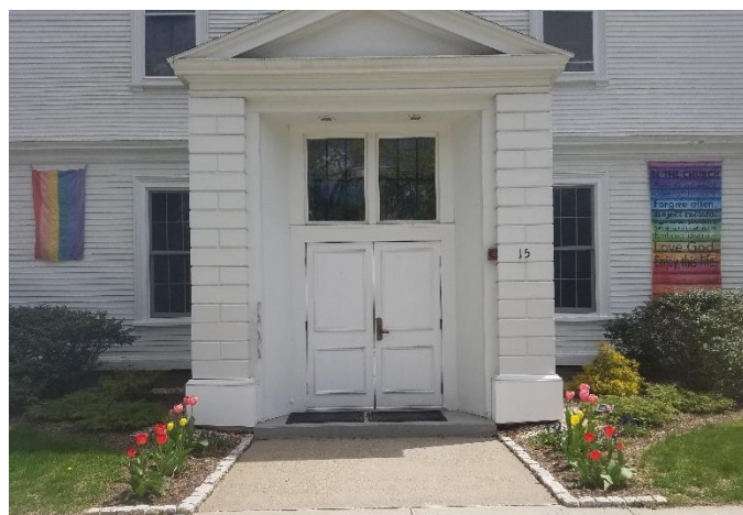
Our church in the Spring

Thank you for your understanding in helping us make this fund raiser a success.